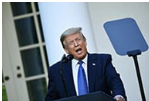
(Story continued on page 6)